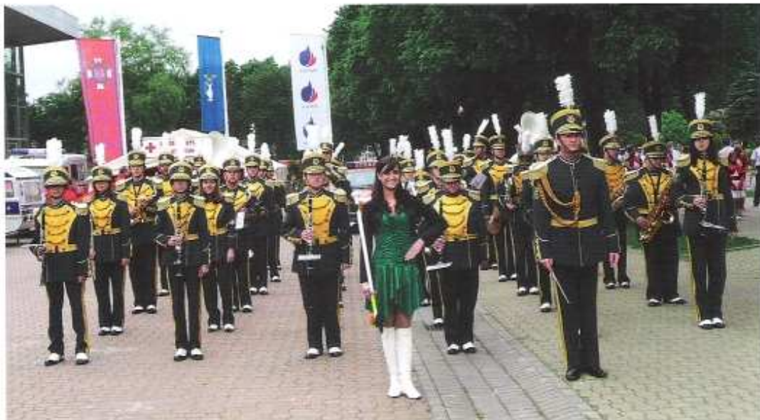
Band of the Voluntary Fire Brigade of Nadarzyn at the Krynica Zdroj